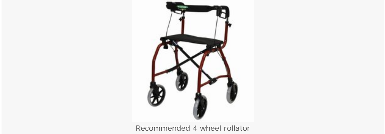
Recommended 4 wheel rollator

We want to stay within the 4 wheel rollators in this post because there is just so much information to be had even within the category. Standard Four Wheel's come in many different styles like the top of the line Ovation Rollators that are recommended by many medical equipment suppliers. Oventions are reliable and versatile. They come in every different size so they will work for everyone. It also has excellent maneuverability, which is the key factor in most walkers with wheels due to that fact that a lot of people have a hard time walking with any of them. It should also be known that every one of the oventions have a dual lock braking system that is essential for everyone who lacks in stability, making it easy to stop and go as needed.