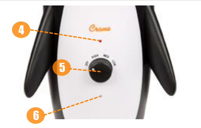
Fig. 3 (Bottom)