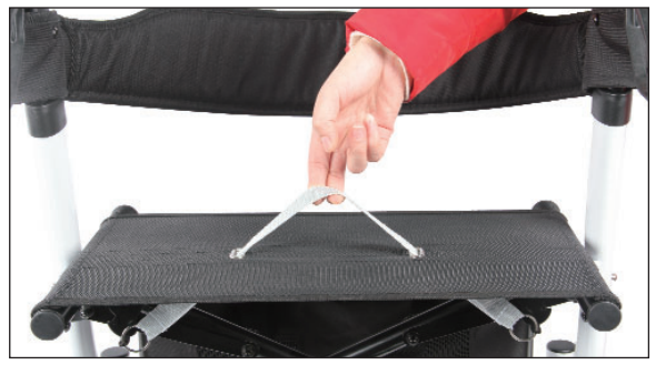
With our ultra compact design, our walker could be easily folded up by pulling the seat grip up with one hand!

* Place both feet firmly on the ground and do not lean backward or sideways.