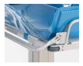
Side raile on bed side fold to horizontal position. Side rail on caregiver side fold all the way down for easier access to patient.