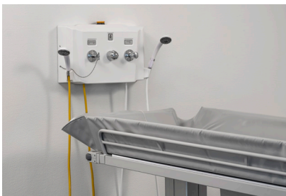
TR4200 with TR2810 Shower Panel