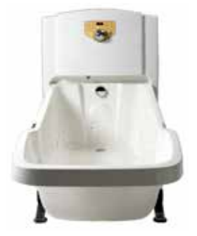
TR 900 Autofill model