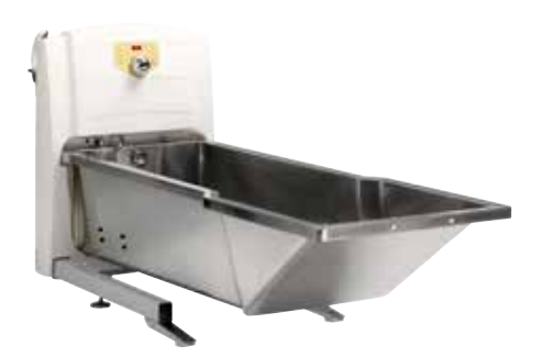
All TR 900 HiLo panels can be delivered with a Stainless Steel bathtub as an option. The Stainless Steel tub has the same functional design as the standard TR 900 glass fibre tub and is manufactured in high quality steel (EN 1.4301).